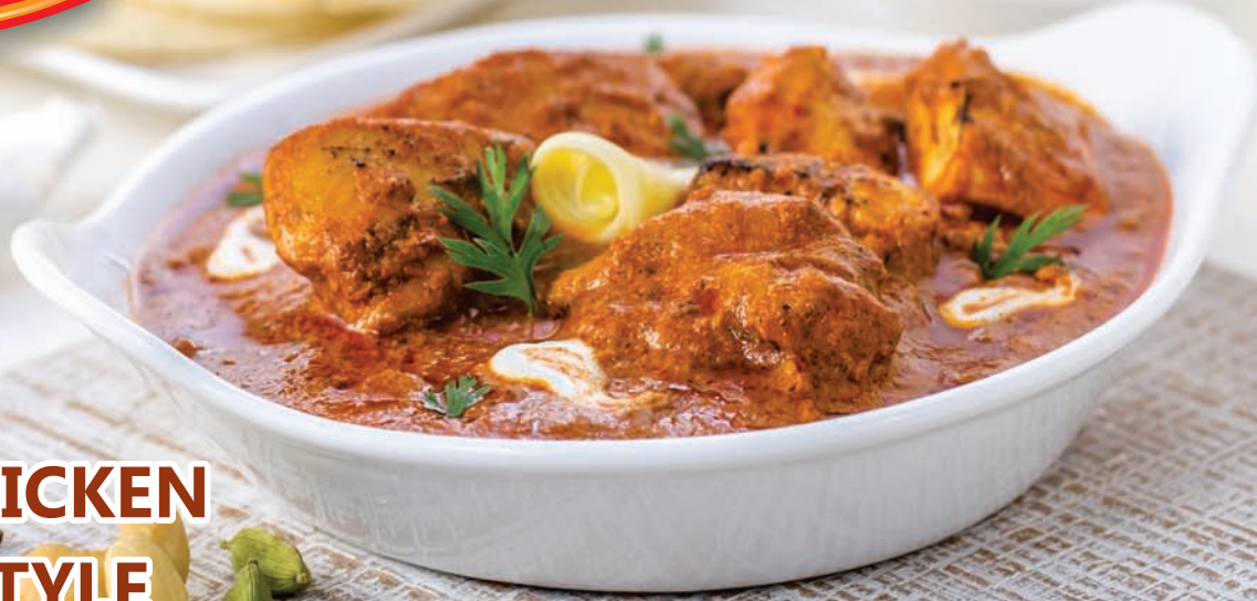
BUTTER CHICKEN DHABA STYLE