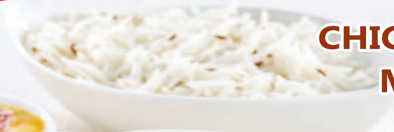
CHICKEN TIKKA MASALA